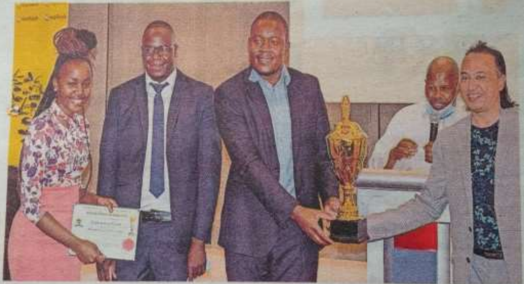
Vehicle and Equipment Leasing Limited team receives a trophy during the Annual Industry Leadership Recognition Programme dubbed Pacesetters Awards organised by